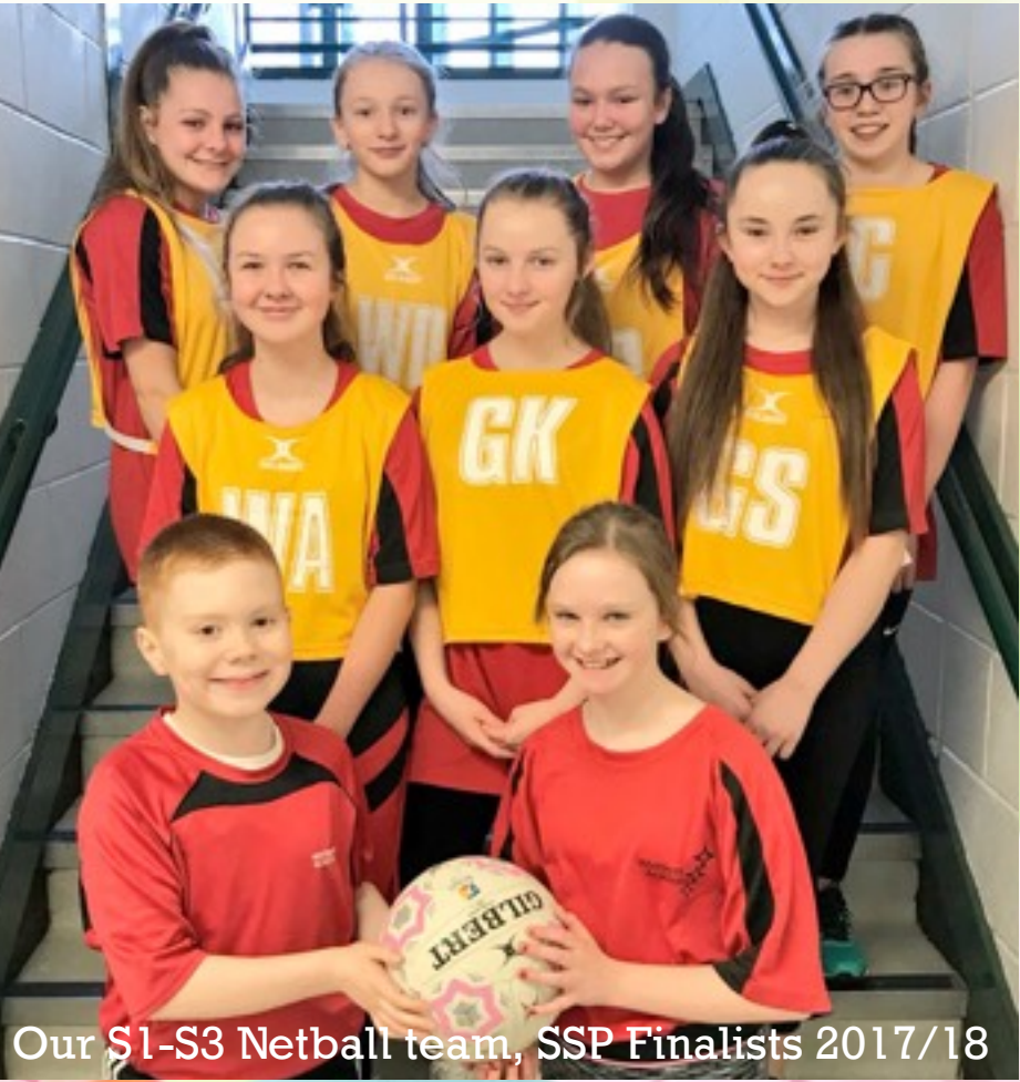
Our S1-S3 Netball team, SSP Finalists 2017/18