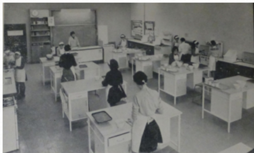
(Home Economics Department 1967)

The layout of the school when it first opened was a bit different to what it is now. The original entrance hall has been narrowed with part of it converted to offices. The Art Department, which is now located on the newest part of the ground floor between the original Gym halls and the remainder of the 70's built extension, was located on the 3rd floor along side the Geography Department. Geography is now located on the 2nd floor as part of the Social Subjects faculty. The 3rd Floor now contains the Maths and Business Studies Departments.