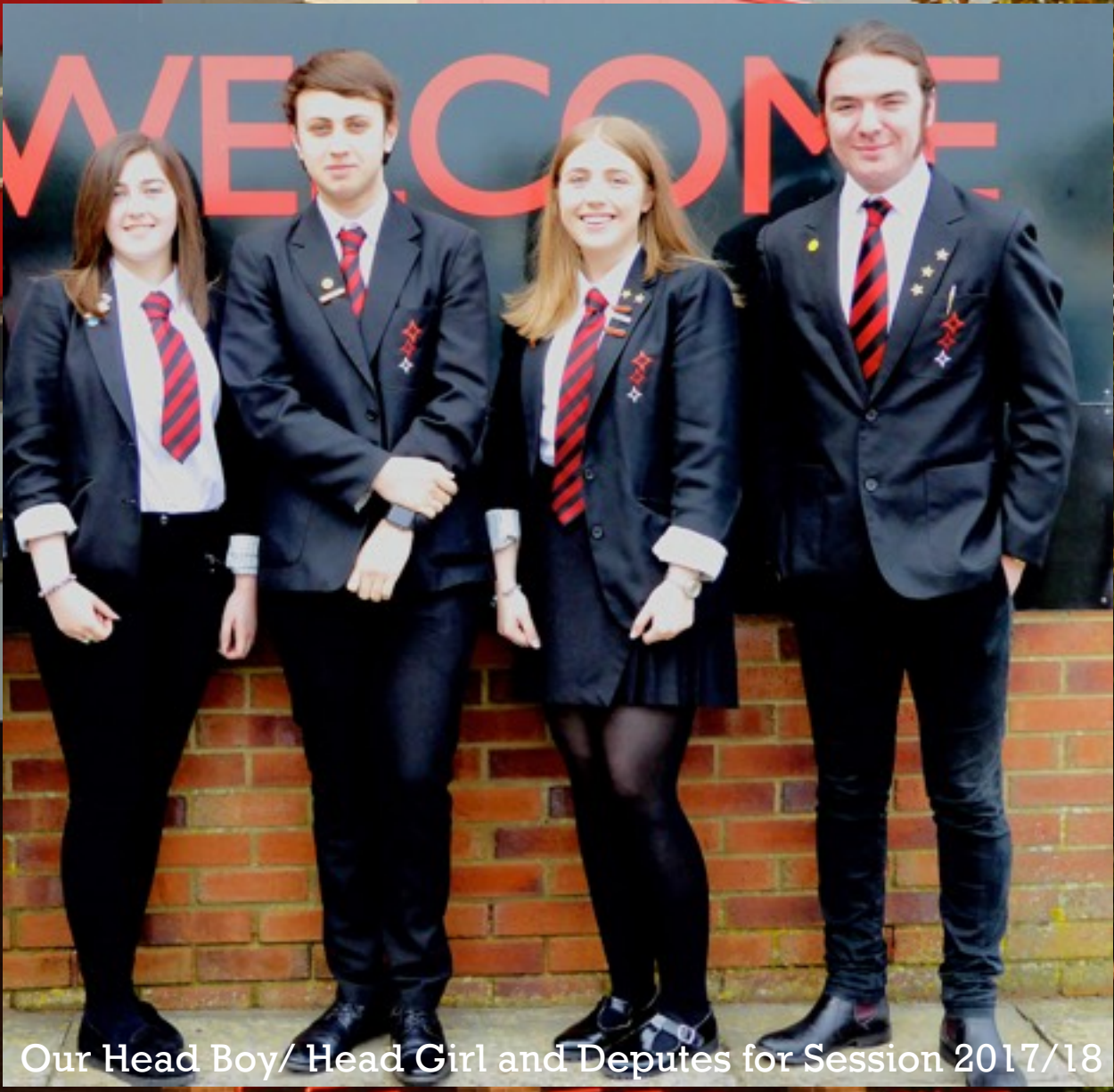
Our Head Boy/ Head Girl and Deputes for Session 2017/18