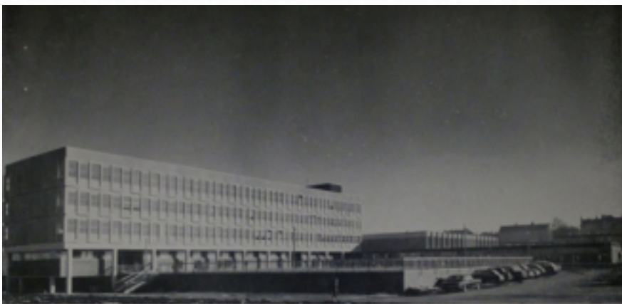
(Whitburn Academy 1967)

On 22nd August 2017, Whitburn Academy opened its doors for the start of its 50th school year.