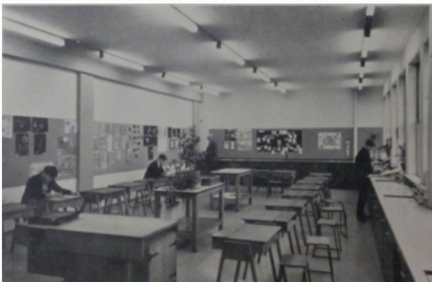
(The Art Department 1967)

room. In the Commerce department, it was soon discovered that the fitted desks were built too small meaning the mechanical carriage returns on the typewriters would collide with each other as the pupils were typing!