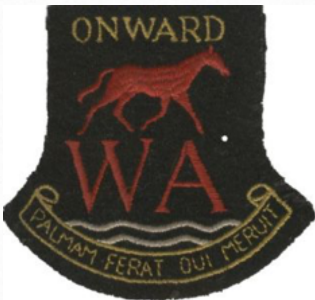
(School Badge from 1967)

Despite all the chaos and disruption caused by the building works during that first year, the school managed to achieve an exceptional 358 'O' Grades, 118 Higher Grades in the S.C.E exams and a Sixth Year Studies Certificate in French.