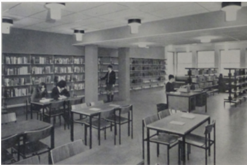
(The Library, 1967)

classes, a staff base and the drama studio. The library was later moved to the extension before moving back into the main building when the extension was demolished. Today's library is where the original Janitor's room, prefects and student common rooms were located.