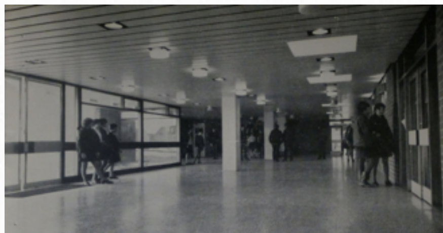
(The Foyer 1967)

During the first few months: the Language Laboratory had no equipment installed as the supplier refused to install anything whilst there was still work being carried out on the room. In the Science Labs and Homecraft (Home Economics) rooms, there was no gas, water or electricity, the storage cupboards were incomplete and Homecraft still had no ovens. Meanwhile, the Technical Department had to finish building the desks and worktops in their own department by themselves!