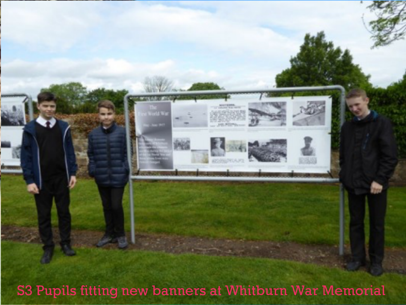
S3 Pupils fitting new banners at Whitburn War Memorial