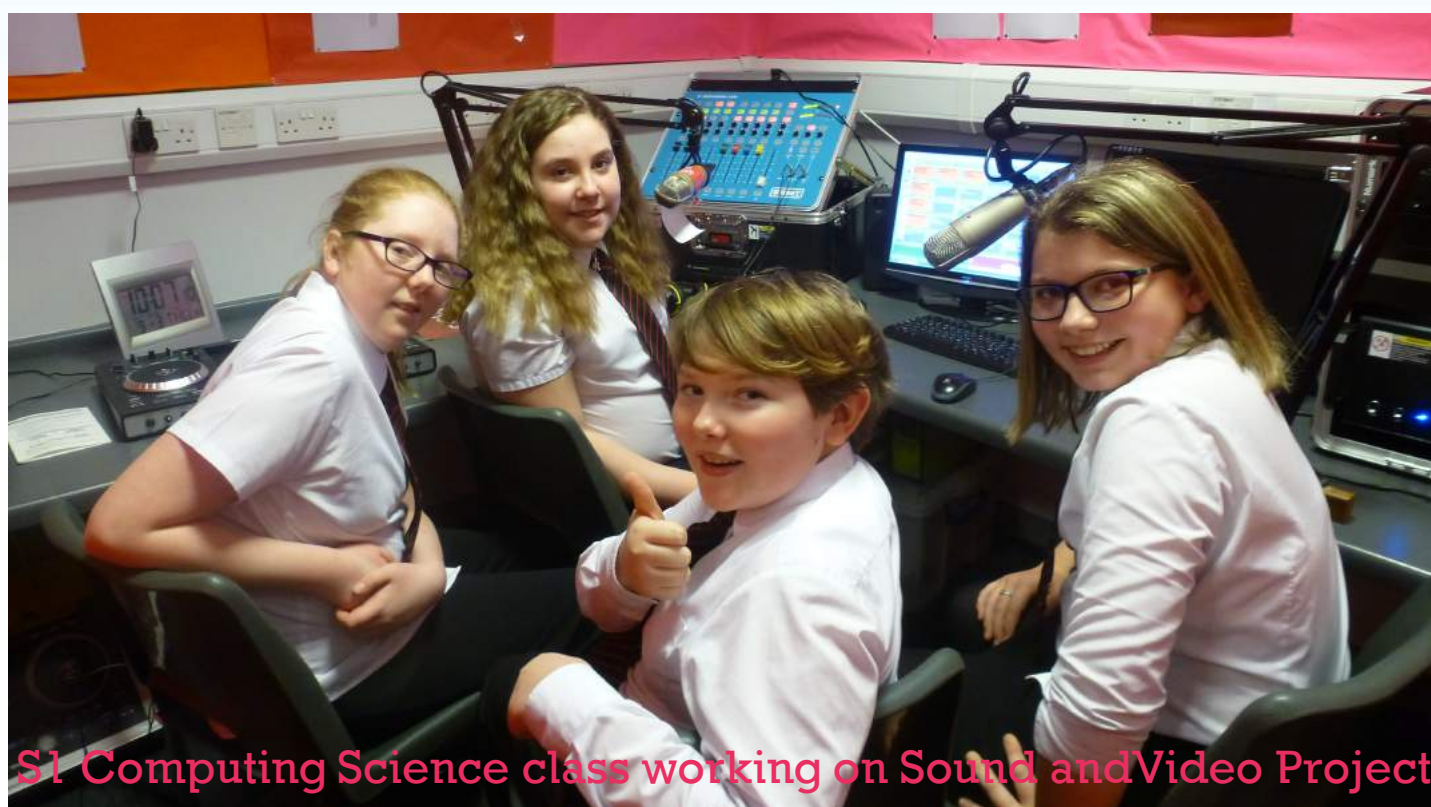
S1 Computing Science class working on Sound and Video Project