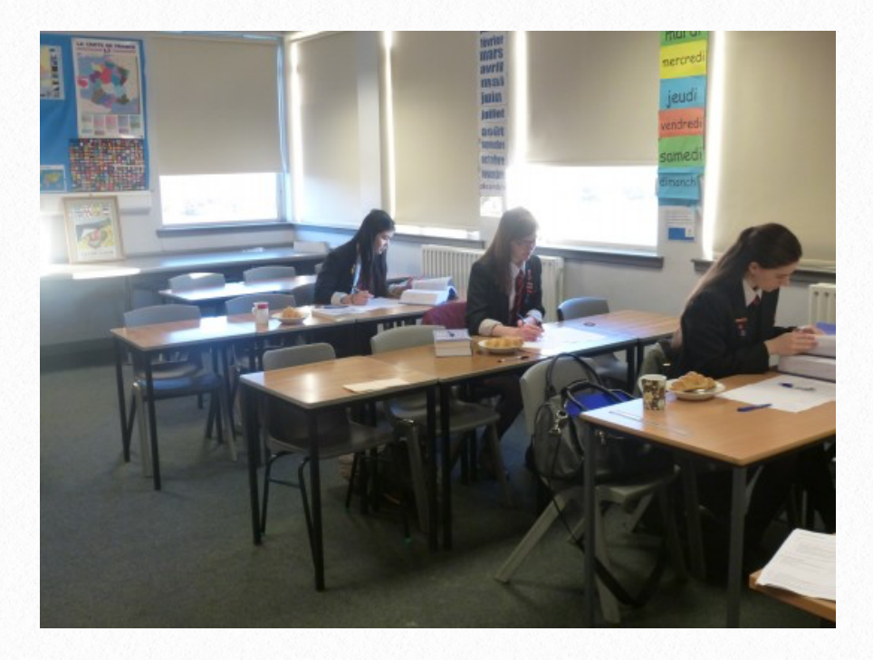
could be used! We prepared for the competition by practising with previous years' texts which allowed us to gain insight into what the competition would be like.

On the 24th November, Whitburn Academy was chosen to take part in a European translation competition called "Juvenes Translatores". The competition is organised by the European Commission for schools in countries that are part of the EU. On the day of the competition, we spent two hours translating a text from French into English using just a dictionary - no online resources