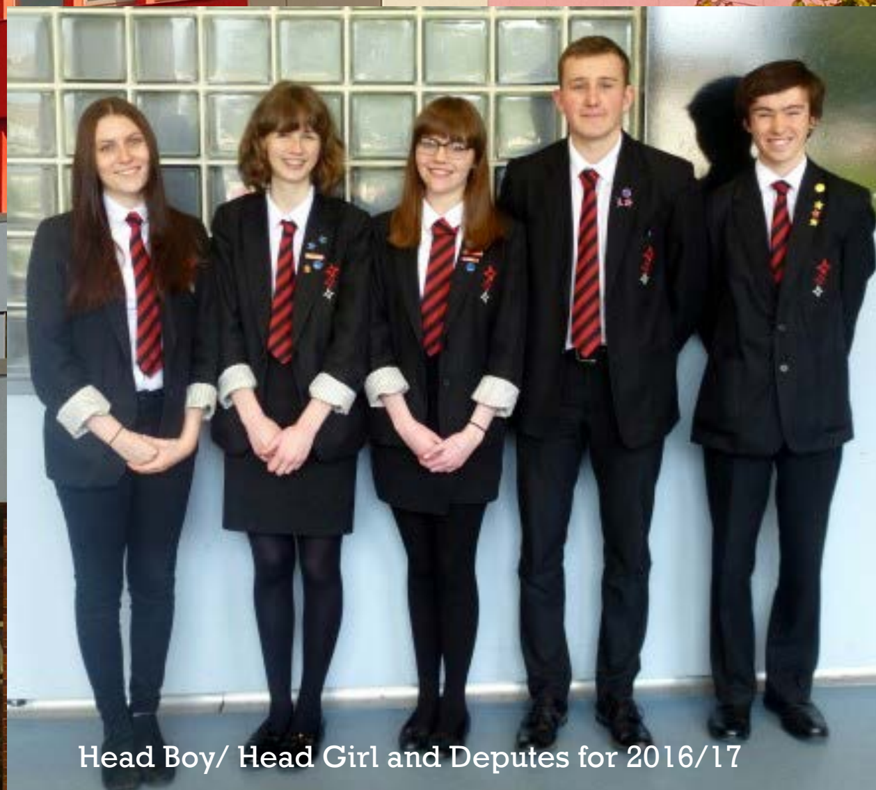
Head Boy/ Head Girl and Deputes for 2016/17